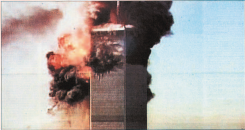
In this image from television, a jet of the supplies from one of the towers of the World Trade Center in New York after a plane crashed into it. The aircraft was the second to fly into the towers this morning.