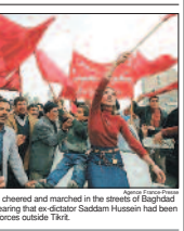
Subjunctive Iraqis cheered and marched in the streets of Baghdad yesterday upon hearing that ex-dictator Saddam Hussein had been captured by U.S. forces outside Tikrit.

'A hopeful day has arrived' in Iraq from ordinary Iraqis was the greeting of the day, a reprise of Lt. Paul Bremer's statement to the Iraq people. "We will not have to fear the rule of Saddam Hussein ever again," he said. "A hopeful day has arrived." The American invasion captured him made an attempt to hide their confinement "He was in the bottom of a hole, on there was no way he could fight back," said Maj. Gen. Raymond Odemore, commander of the 4th Infantry Division troops who seized Saddam. "He was caught just like a rat." Though armed with a rifle, he made an attempt to take his own life in the minutes following his capture, but he was not. The crisis of "they got him?"